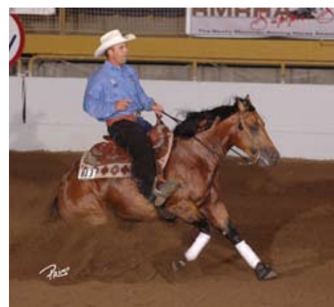
Showing the versatility of Holy Cow-bred horses, Once A Von A Time started his career as a top reining horse with trainer Craig Schmersal before moving to the cow horse arena.