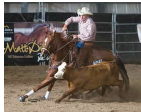
Lipschic's first money-earner was Kiss My Shiny Lips, a $40,000-plus earner who is showing promise as a young broodmare.